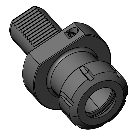
STRAIGHT VDI40 STATIC TOOL OUTPUT: ER40 COOLANT: INTERNAL